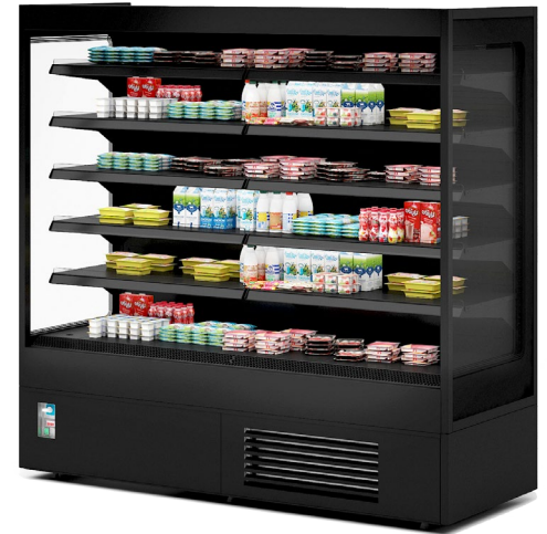
Available with doors