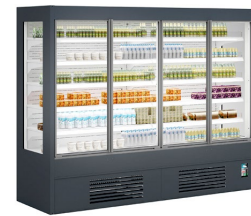
Available with doors