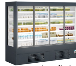
Available with doors