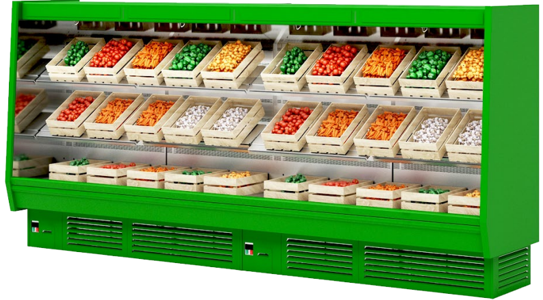
Baskets not included